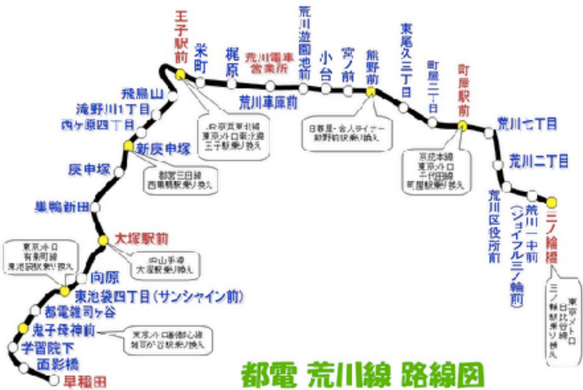
都電 荒川線 路線図